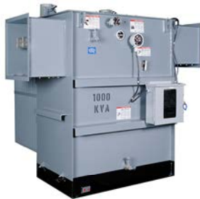
Liquid Filled Substation