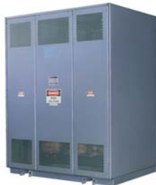
Style F—NEMA 1 Rated