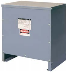
Style E—IP55 Rated

These dimensions are not for construction. Contact your local Schneider Electric representative for certified prints.