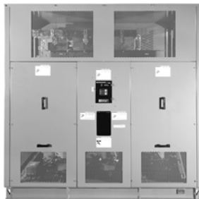
Power Dry II™