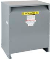
Style D and H—Type 2 Rated Converts to Type 3R with Weathershield