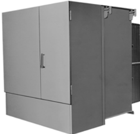
Liquid Filled Pad Mounted