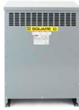
Style K—Type 2 Rated Converts to Type 3R with Weathershield