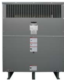
Style D, NEMA 1 Rated

Special outdoor construction required for NEMA 3R applications. Contact your local Schneider Electric sales office for details.