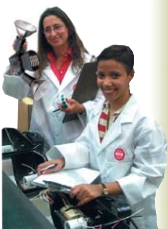
RAB Quality Inspectors check a production run. Customers consistently rate RAB #1 in Product Quality.