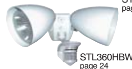
STL360HBW page 24