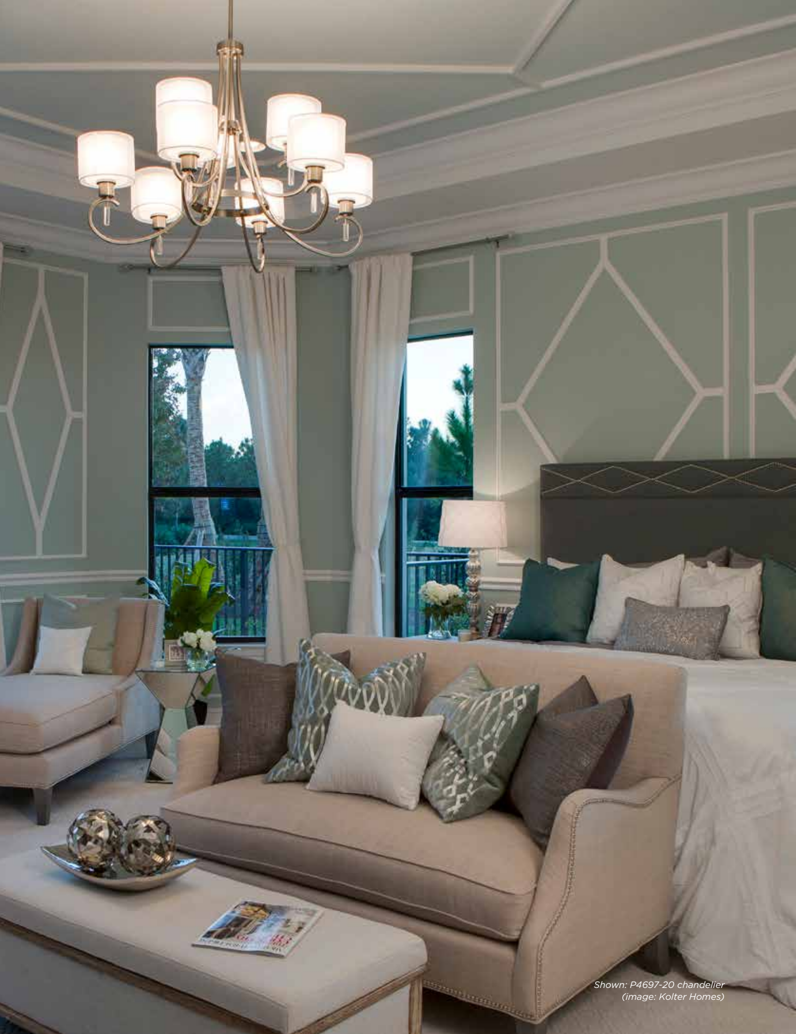
Shown: P4697-20 chandelier