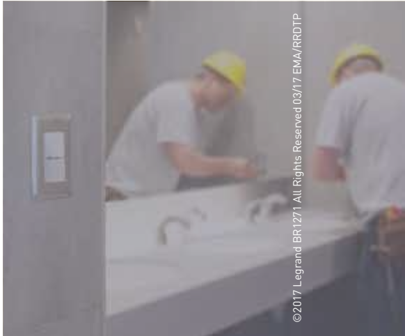
©2017 Legrand BR 1271 All Rights Reserved 03/17 EMA/RRDTP