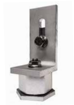
METAL ROOF BASE WITH L FOOT 242-02037