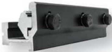
Bonding Standard Rail Splice, Black 242-04015