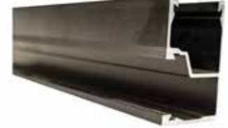
Standard Black Rail 015-09816