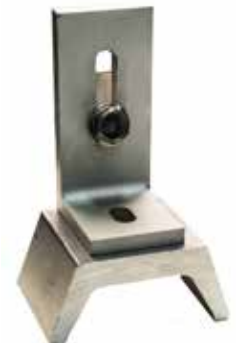
CORRUGATED STRADDLE BLOCK WITH L FOOT 242-02046