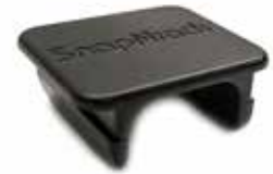
Snap-in Wire Retention Clip 232-01106