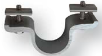
Bonding Pipe Clamp for 1 1/2" 242-09004