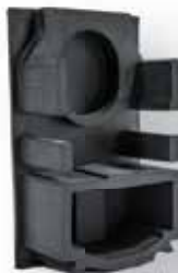
Standard Rail End Cap 232-01023