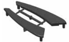
Skirt End Cap Pair 232-01250