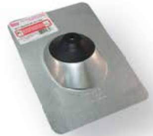
Standoff Flashing, Oatey No Caulk 015-00162