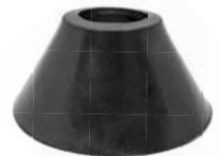
RUBBER RAIN COLLAR 232-01000