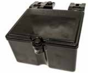
Junction Box R 242-01104