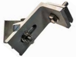
STANDOFF CLAMP AND L FOOT ASSEMBLY 242-09002