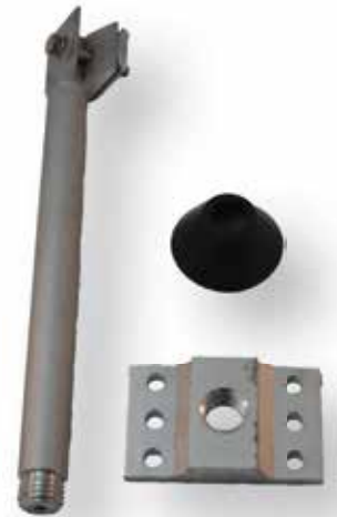
HD Standoff Kit, 12" 242-92074

HD Standoff Kits include a 6-Hole HD Base, HD Standoff Shaft, Rubber Rain Collar, and a Standoff Clamp assembly.