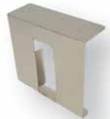
UEC Rail Cutting Tool 232-02284