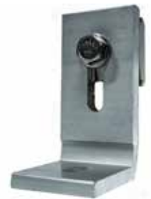
SILVER COMPOSITION L FOOT (92 DEG) 242-09005