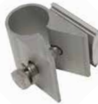
STANDOFF CLAMP ASSEMBLY 242-04100