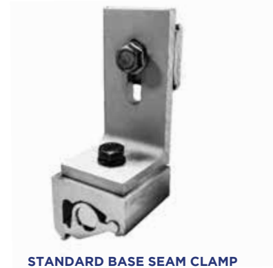
STANDARD BASE SEAM CLAMP WITH L FOOT 242-05150