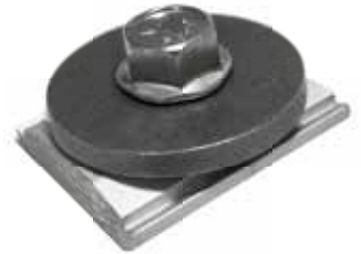
MLPE Rail Attachment Kit 242-92093

MLPE Rail Attachment Kit includes over-sized Fender Washer, Channel Nut and serrated Flange Bolt.