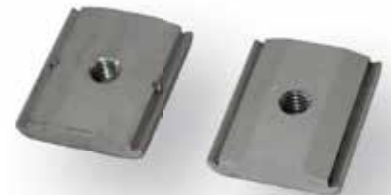
Bonding and Original Channel Nuts 232-02009 232-02005