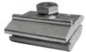
Ground Lug R for 6-12 AWG 242-02101