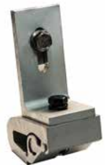
WIDE BASE SEAM CLAMP WITH L FOOT 242-05151