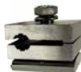
Hanger Bolt Clamp 242-01102