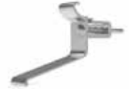
Skirt Frame Mount 242-92211