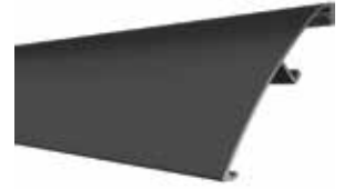
Skirt, 162" (Bundle of 60) 232-01259