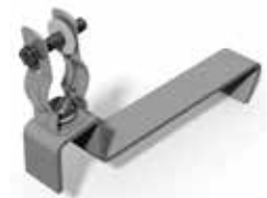
Conduit Support for Tile, 3/4" EMT 242-02104