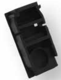
Ground Rail End Cap 232-01043