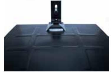
BLACK L FOOT, BLACK GALV FLASHING, AND BASE KIT 242-92051