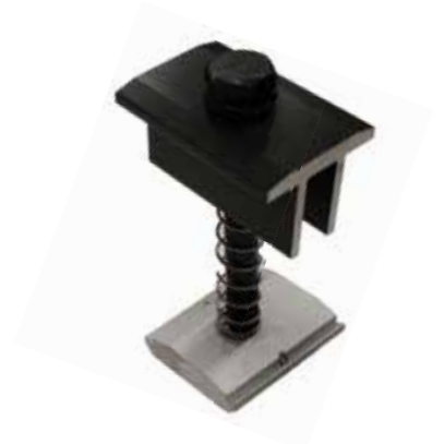
Bonding Mid Clamp, 1.31" - 1.77", Black 242-02054