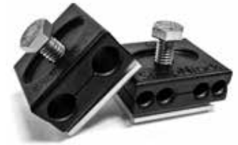
Trunk Cable Clamp & 4-Wire Clamp for Rail 242-02103 242-02102