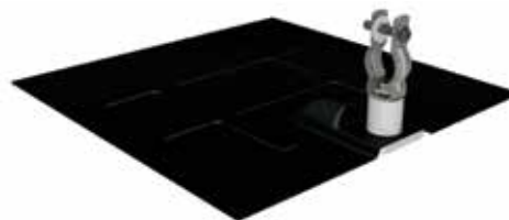
Conduit Support Kit for Comp, 3/4" EMT 242-02106