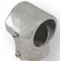
Single Socket Tee, Hollaender 172-05800