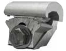
Universal End Clamp 242-02215