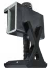
Bonding Adjustable End Clamp, 1.49" - 2.00", Black 242-02068