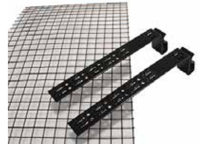
Array Edge Screen Kit, 4" x 100', 40 Clips 015-11176