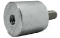
1" STANDOFF SPACER w/ CONNECTOR SCREW 242-92081