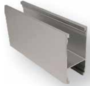
Ground Rail Set, 122", Silver 015-09839