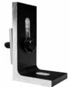
BLACK ALL PURPOSE L FOOT (90 DEG) 242-09020