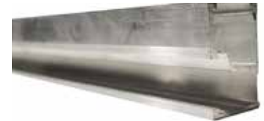
Standard Silver Rail 015-09814