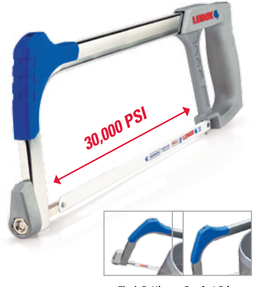
Flush Cutting Comfort Grips