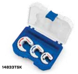
Tubing Cutter Accessories