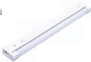
Linkable, Beam Adjustable Under Cabinet Light