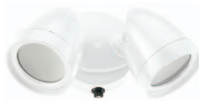
White Security Light