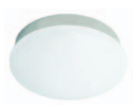
11in. Spin Light