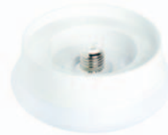
7in. Spin Light