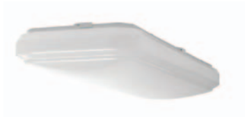
Reva Stepped Lens