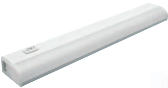
Linkable Under Cabinet Light