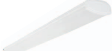
4ft. Wrap Light