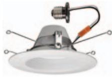
Recessed Retrofit Downlight Kit