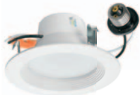
Color Preference™ Recessed Retrofit Downlight Kit