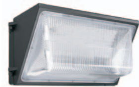
18in. Wall Pack