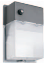
Small Wall Pack