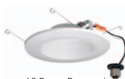
AC Power Recessed Retrofit Downlight Kit