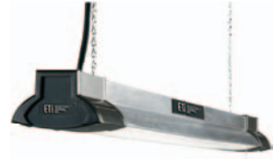
Shop Light with Bluetooth Speakers