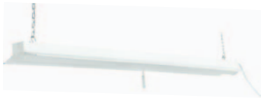
Linkable Shop Light