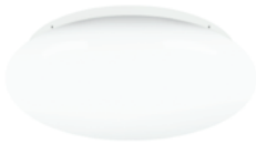
12in. & 16in. Low Profile