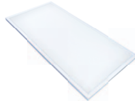
2' X 4' Premium Flat Panel