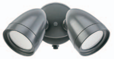
Dark Bronze Security Light