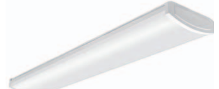
4ft. High Lumen Output Wrap Light