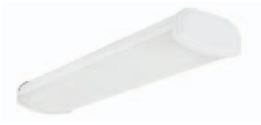
2ft. Wrap Light