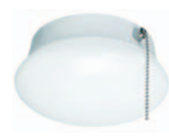
7in. Spin Light with pull chain