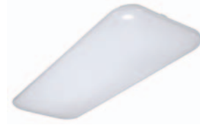
Traditional Smooth Lens