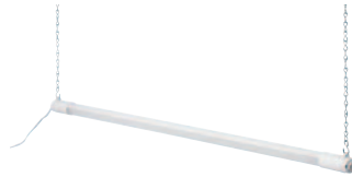
Shop Light Bar