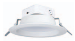
8in. High Output Downlight