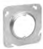
TP569, TP570, TP571 TP573, TP575