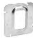
TP574-TP582, TP529, TP531