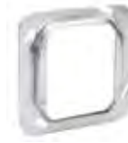
TP584, TP586, TP589, TP593, TP541, TP543