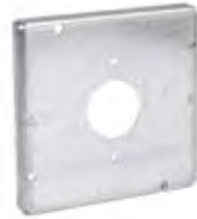
TP724, TP730, TP736