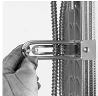
Bend tab as shown.