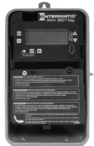
Shown in indoor/outdoor lockable metal enclosure

Follow these instructions to complete the installation and programming of the ET2815 time switch.