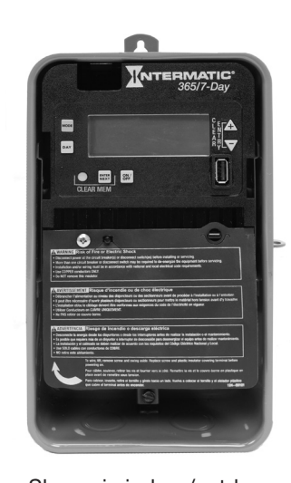
Shown in indoor/outdoor lockable metal enclosure

The time switch features an LCD and panel-mounted control buttons to set, review, and monitor the time switch functions, including setting date and time, schedule creation, enabling or disabling Daylight Saving Time (DST) and configuring DST switchover dates. Follow these instructions to complete the installation and programming of the ET2705 time switch.