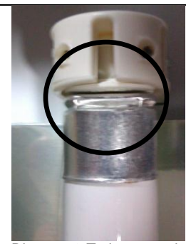
Diagram 2-T5 lamp seating

The dimple on the lamp base is aligned with the slot in the lamp holder.