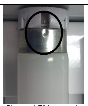
Diagram 1-T8 lamp seating

WARNING: Improper seating of lamps can create a fire hazard. Whether field or factory installed, ensure lamp position is correct before energizing fixture. See Diagrams 1 and 2.