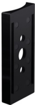
Pole adaptors for ALED Area Lights Color: Bronze Weight: 0.5 lbs