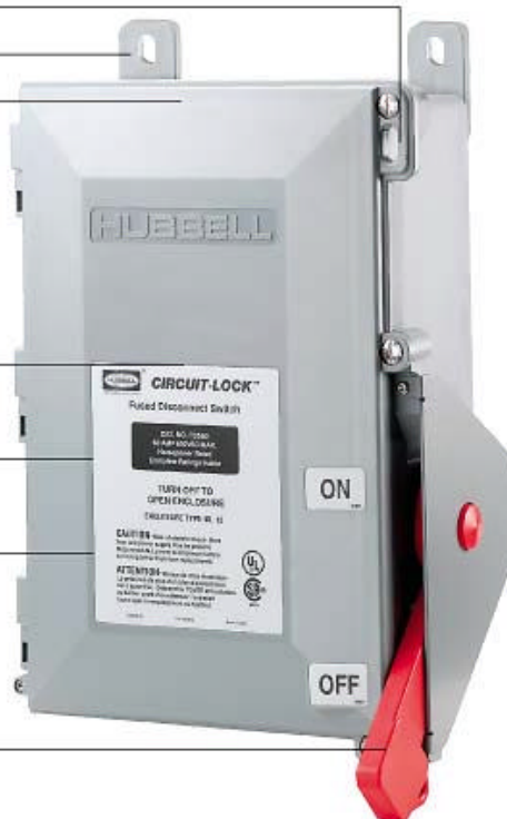
60A Fused Disconnect Switch

Lockable high visibility red handle to meet OSHA Lockout/Tagout.