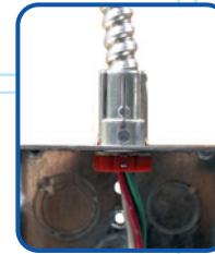
Snap into knockout from inside the box