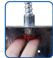
Push fitting and conduit back thru knockout