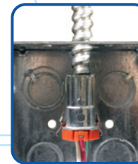
Snap conduit into the fitting