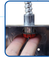
Squeeze tabs to release fitting for removal