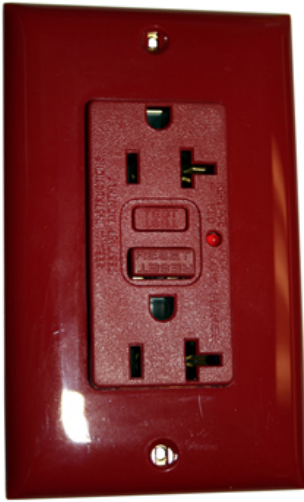
20A 125V AC, LED Series

20A 125V, 2P 3W, Flush Thermoplastic Face, Back & Side Wired, Matching Wall Plate Included, Ivory