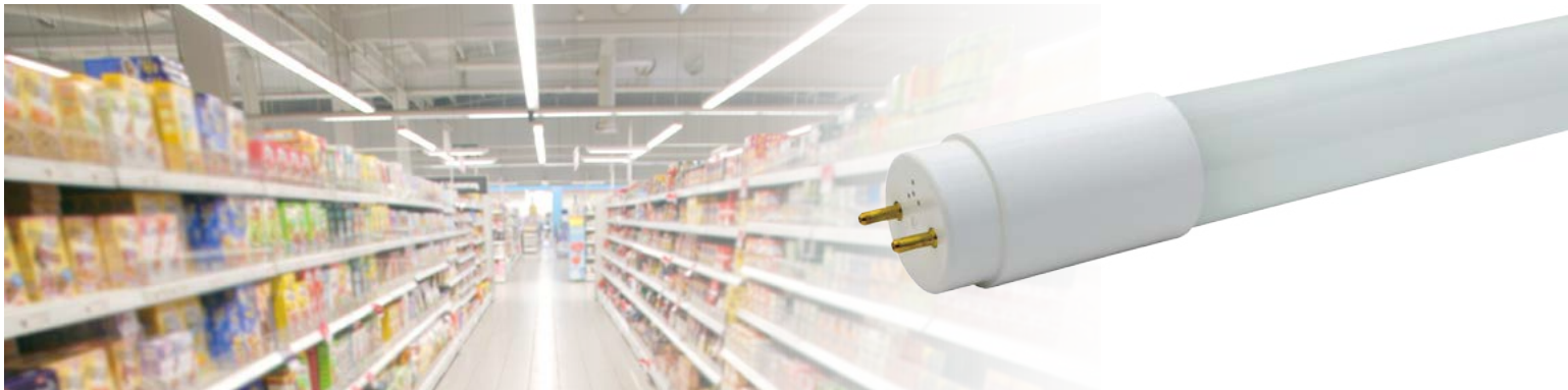
Application illustration only, subject lamps not used in photo.