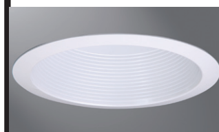
ERT772WHTTS White Trim, White Baffle with White Reflector