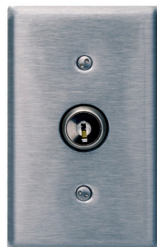
GreenMAX Key Switch

Leviton GreenMAX® Digital Switches are 100% digital. Specifically designed for use with GreenMAX Relay Control Panels, GreenMAX Digital Switches utilize LumaCAN protocols for unparalleled programming flexibility. All communication and monitoring functions can be performed from any GreenMAX Digital Switch location. Simply connect the GreenMAX Handheld Display Unit (HDU) to any GreenMAX Digital Switch for easy programming and system control of all devices on the GreenMAX network. Available in 1-, 2-, 4-, 8-button and keyswitch configurations, these switches connect using RJ45 connectors and CAT6 cabling. For dimming applications, use 4-button switch with dimming module for control of 0-10V dimming circuits.