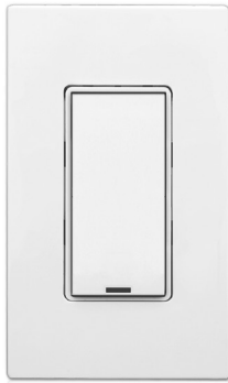
GreenMAX Digital Switches