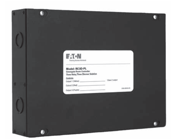
Model RC3D-PL Shown