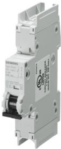
CIRCUIT BREAKER 240V 14KA, 1-POLE, D, 10A, D=70MM ACC. TO UL 489