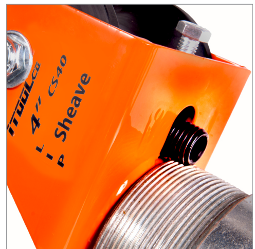
Fully adjustable thread depth

L.I.P. ™ (Lock-in-Place) Conduit Feeding Sheaves lock in place at any angle or inclination. The phenolic resin wheel is more durable than cast and won't dent or break. Unlike conventional sheaves, L.I.P. ™ Conduit Sheaves enable the installer to stay clear of the equipment, keeping hands and limbs safety out of the way. Needle bearing rollers ensure a smooth installation by minimizing drag on the pull and reducing the risk of damaging valuable wire.