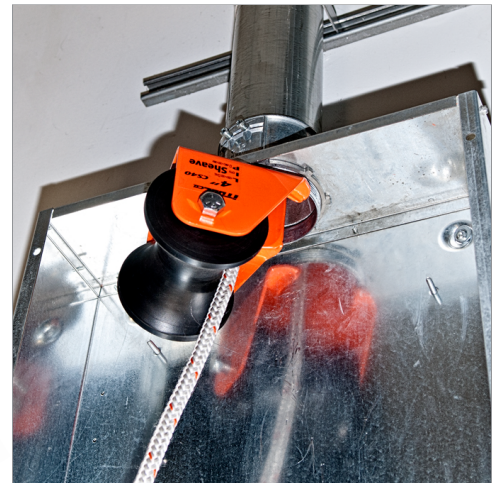
Locks in place - overhead at any angle - in under a minute