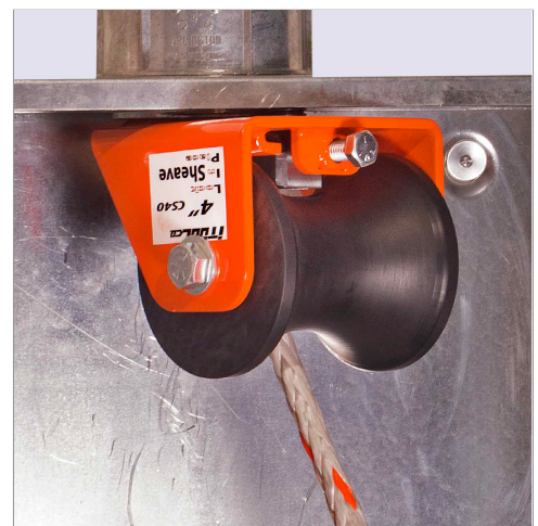
Reduces risk of damaging valuable wire

L.I.P. ™ (Lock-in-Place) Conduit Feeding Sheaves lock in place at any angle or inclination. The phenolic resin wheel is more durable than cast and won't dent or break. Unlike conventional sheaves, L.I.P. ™ Conduit Sheaves enable the installer to stay clear of the equipment, keeping hands and limbs safety out of the way. Needle bearing rollers ensure a smooth installation by minimizing drag on the pull and reducing the risk of damaging valuable wire.