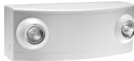
30 Watt Capacity with deep housing