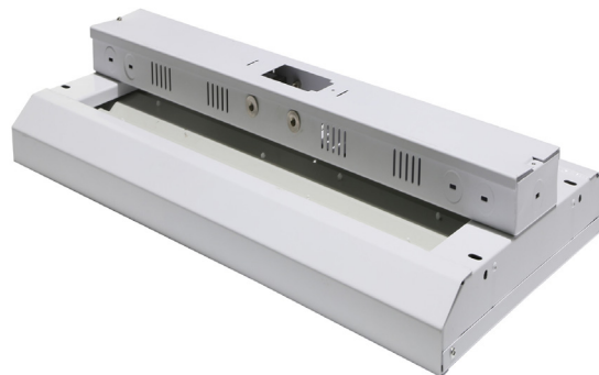
DLC Premium HBP24-LED105FRDMV50

Dimensions and specifications subject to change without notice.