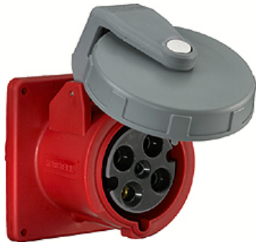
Watertight IEC Pin and Sleeve Receptacle, 3P4W, 100A 3PH 250V