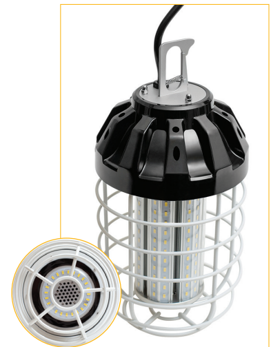
TIGER 60-WATT LED