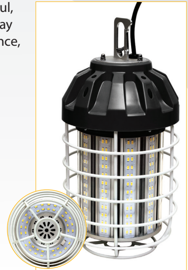
TIGER 100-WATT LED