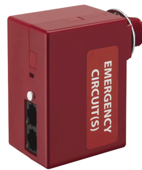
Model #: nPP16 (D) ER EFP