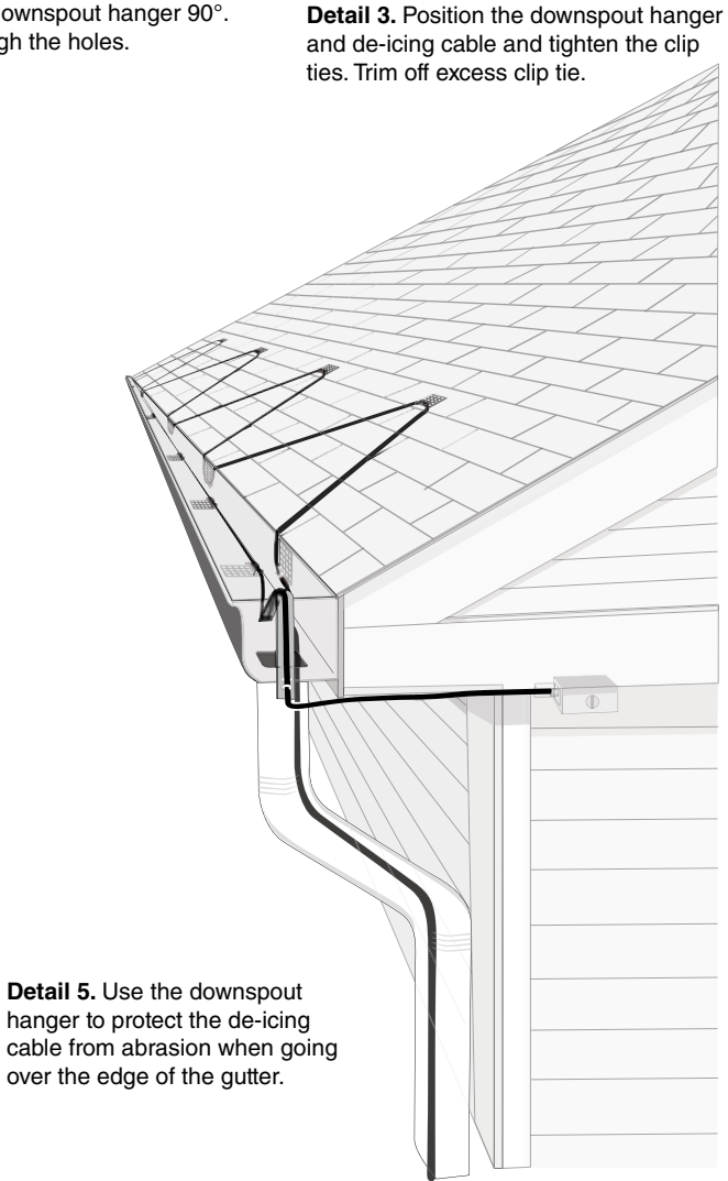
Detail 4. The downspout hanger and de-icing cable should be centered on the edge of the downspout to prevent abrasion of the de-icing cable and support it in the