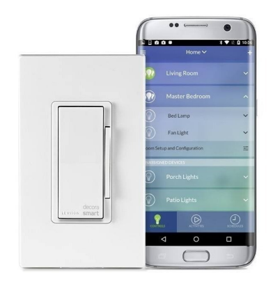
Decora Smart WiFi Dimmer