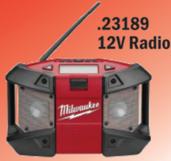
.23189 12V Radio